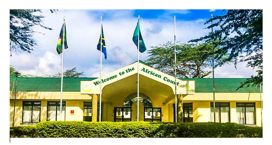
The African Court on Human and People's Rights, in Arusha

On the jurisprudential front we feature elsewhere in this issue a case decided by the Kenya High Court regarding a Somali refugee who had refugee status, who was rescued by the court on the brink of deportation. In addition, we report on two other notable cases recently handed down in South Africa.