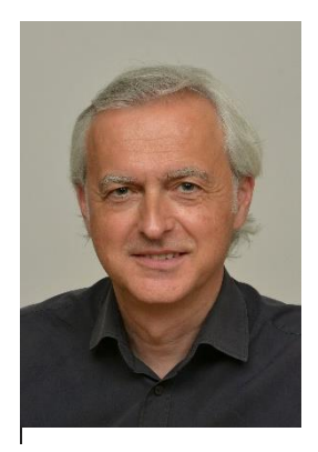
Judge Boštjan Zalar President Europe Chapter

During the House of Commons debate in April 2022 the Home Secretary, Priti Patel, stated that over 130.000 refugees have been resettled in Rwanda and that this is not just a safe country, but also a country where both UNHCR and the EU have resettled individuals. Later on, the Deputy Prime Minister and Secretary of State for Justice, Dominic Raab, told media that on 22 May 2022 only 50 people had received notification that the government intends to deport them to central