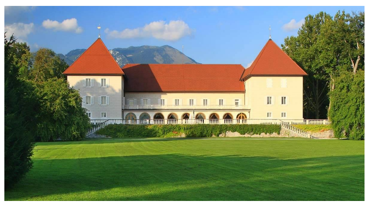
Castle Brdo, Slovenia – the venue for the Europe Chapter conference