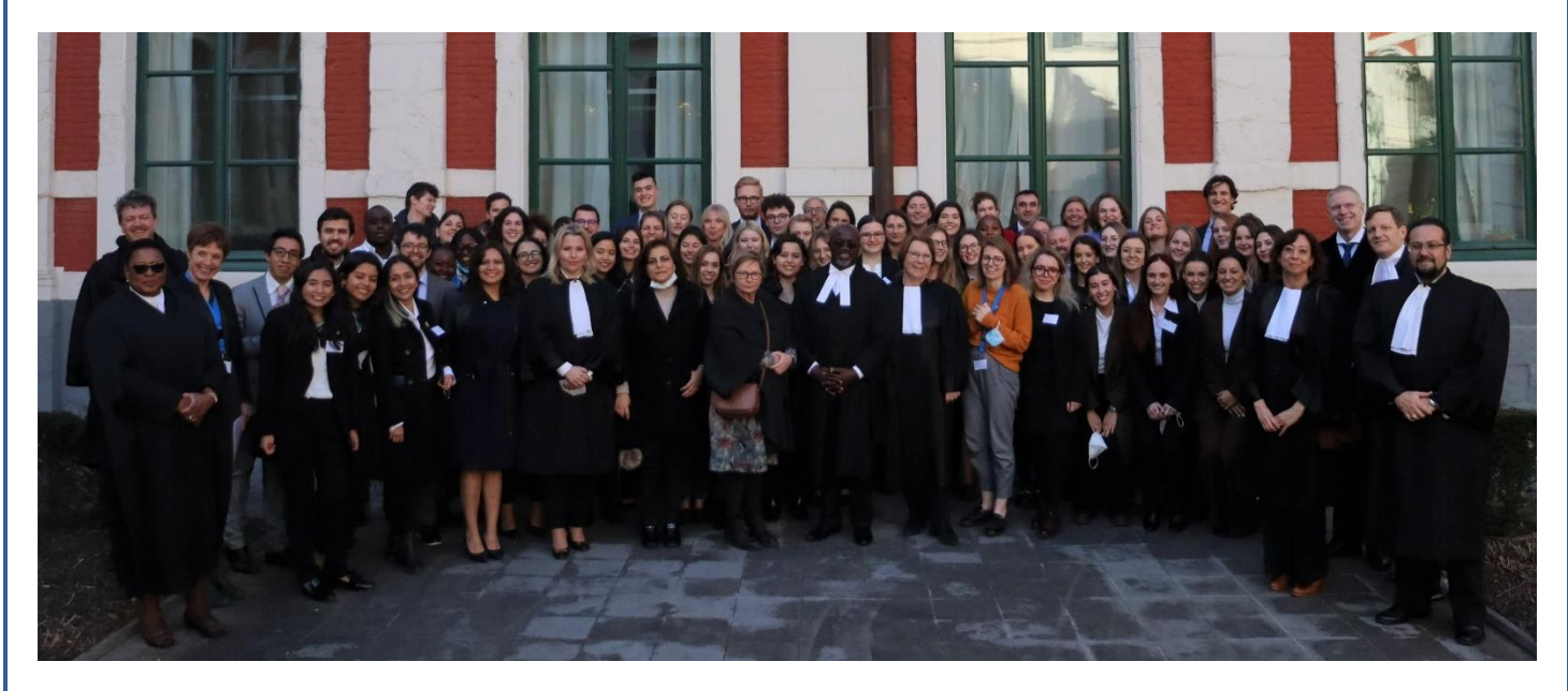
Judges at the recent 2022 Migration Moot Court in Ghent, Belgium - many familiar faces there!