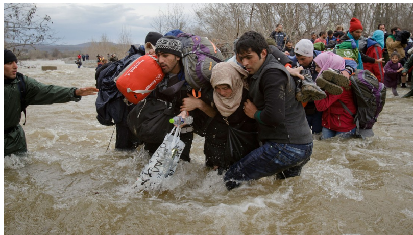
Figure 5: Refugees in Greece, 2016

While Malkki's observation of the most common subjects of refugee photography holds in recent refugee photojournalism, my survey of refugee photography led me to observe several other visual features common to most available refugee photographs. Two elements appear in combination in most of the refugee photographs I surveyed: expressions of pain or suffering and depicted or implied movement (that contributes to a sense of temporariness). Many photographs depict movement toward the camera and feature a frenzied, chaotic scene that illustrates the urgency with which refugees must move. These often depict a group of people running onto a beach; the splashing water and strained faces indicating the effort exerted in the movement.