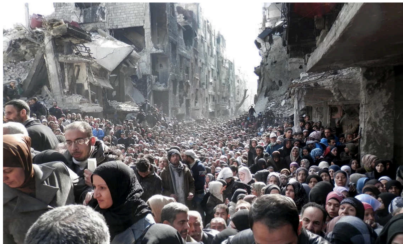
Figure 4: Yarmouk Refugee Camp, photo by UNRWA, 2014

world's attention" by the BBC , 365 and given a clickbait title in the Huffington Post proclaiming, "This one photo will show you just how terrible the Syrian refugee crisis is." 366 This photograph is jarring because of the immeasurable amount of people packed into the image's frame and the desolate ruins that tower above them on both sides.