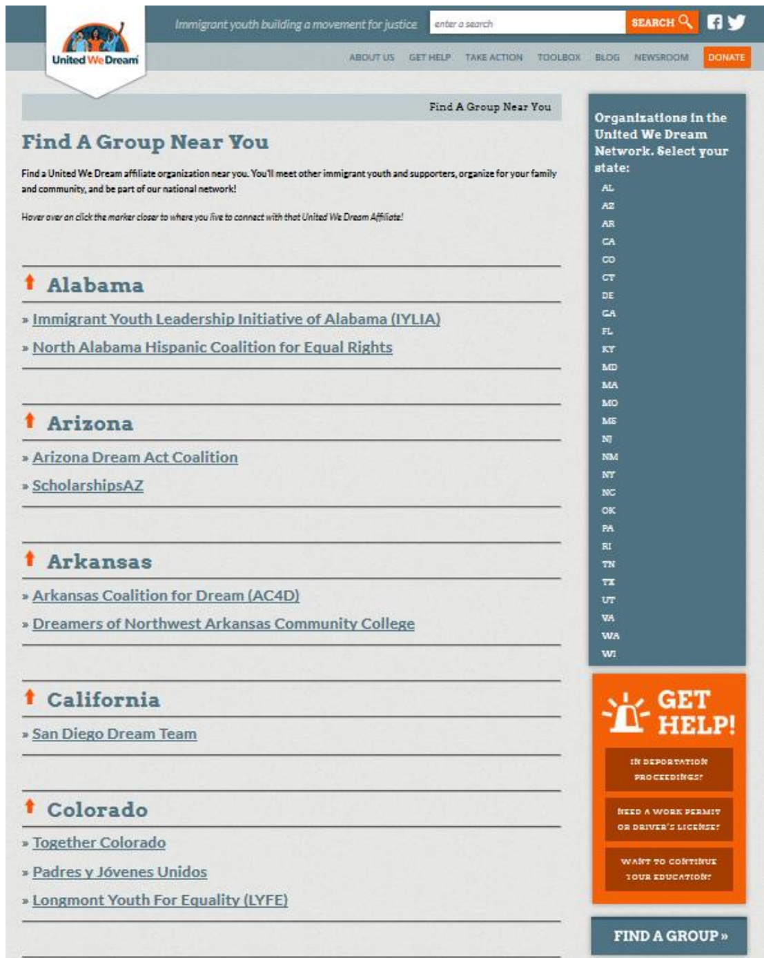
Fig. 2: unitedwedream.org/groups/

For both Queer Refugees for Pride and QUIP, the process of locating oneself on a map bespeaks a process of reterritorialization that facilitates a politics of relocation. Both groups locate themselves and their coalitional partners within the space in which they live and which so far has denied their existence. By placing themselves and their allies on the map, they locate themselves and become intelligible and thus create and anchor their existence. While the placing on the map of an individual could be seen as indicative of an individual politics of relocation (for example, by