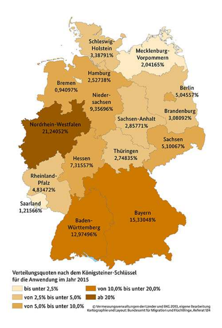
Table 4: Distribution of asylum-seekers in Germany